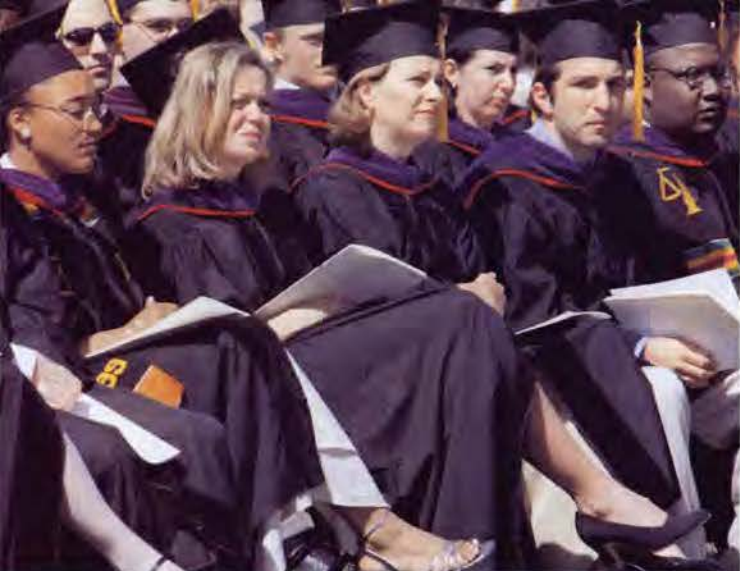
Law School graduation was held May 16, several weeks before University commencement.