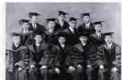
Stanford Law School chapter of Order of the Coif established

1908 Trustees adopt resolution turning Law Department into Law School