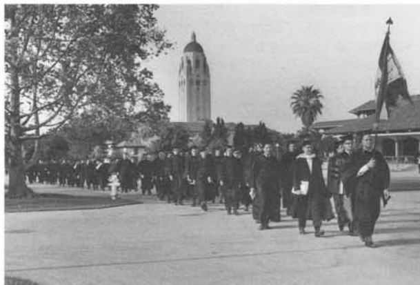
Commencement procession June 18, 1967.