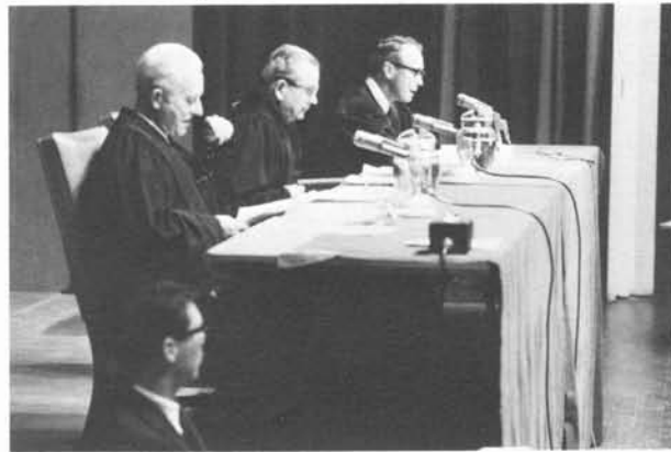
Presiding judges at the 1967 Marion Rice Kirkwood Moot Court Competition.