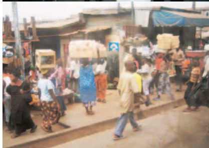
SCENES FROM GHANA.

quently cried, looked despondent and were covered from head to toe in rashes and boils from unsanitary conditions. All of the detainees complained about the lack of plumbing. With little ventilation the heat was insufferable, and with severe overcrowding the detainees had to take turns sleeping on the bare ground. We were told of a special room in which the police would beat suspects to obtain “confessions.” These detainees, most of whom had not been formally charged with a crime, sentenced, or even brought before a judge, had to suffer these horrific conditions. Because they could not make bail, they were forgotten and left to rot inside the jail.