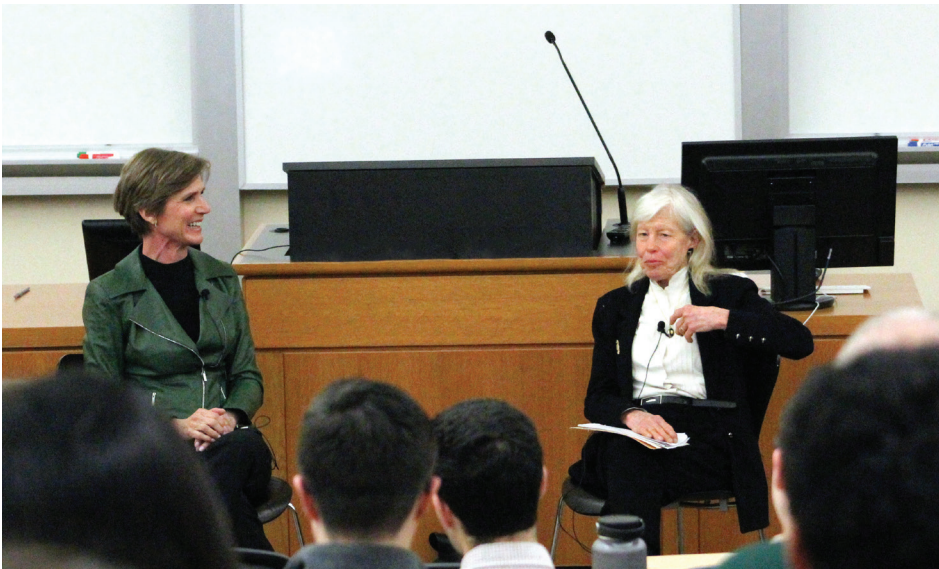
Sally Yates in conversation with Deborah Rhode, February 12, 2019.