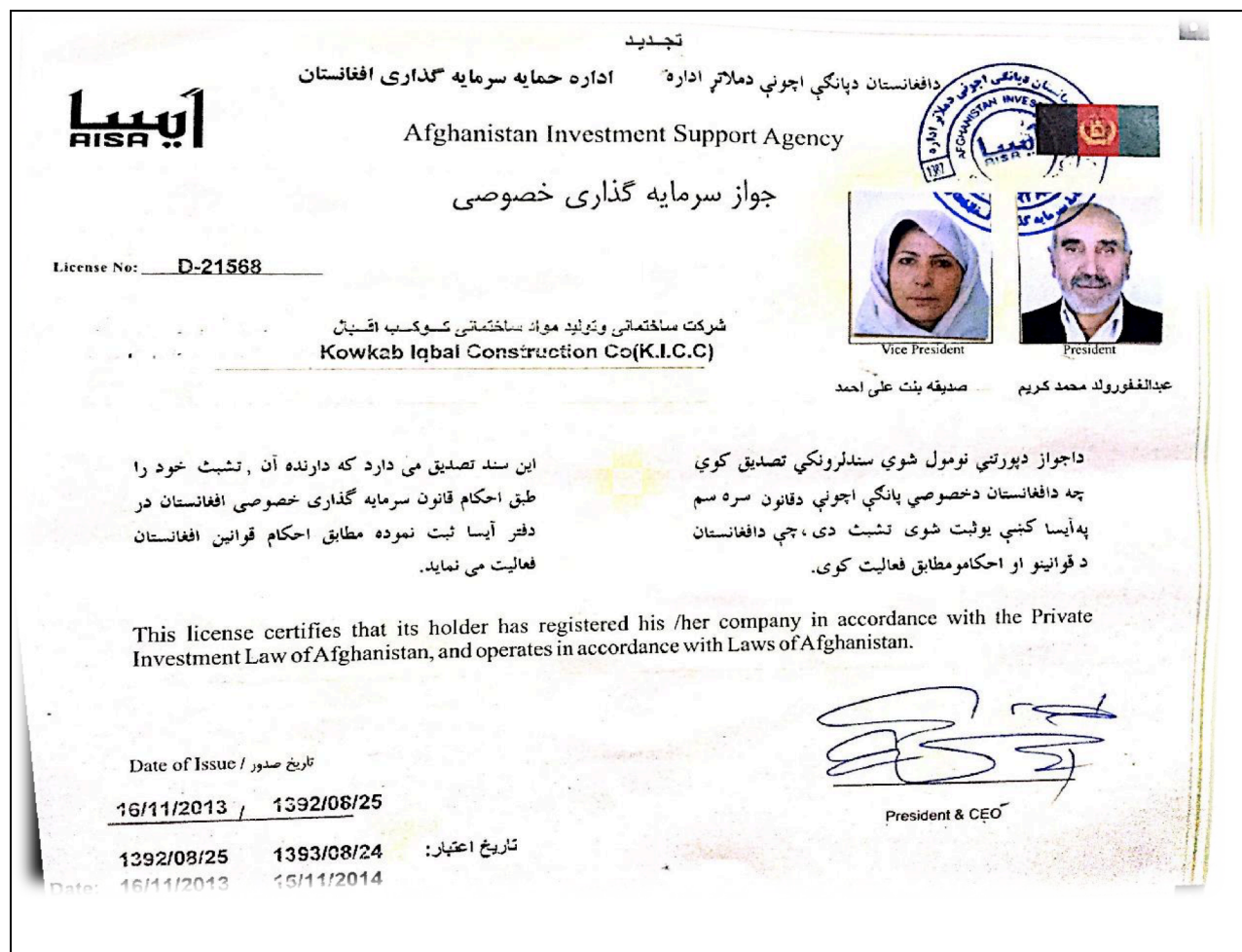
Figure 1: AISA License Sample