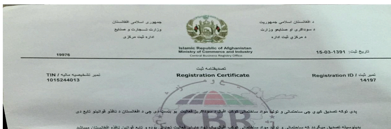
Figure 2: CBR License Sample

The whole process, to gain a license in this industry, is regulated within the Ministry of Public Health. So, we first start off with the information about this organization.