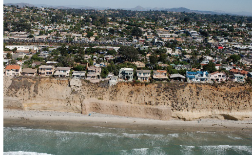
A. Solana Beach, courtesy of California Coastal Records Project