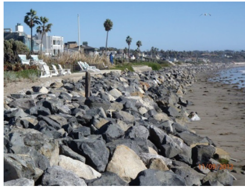
B. Broad Beach, courtesy of Lesley Ewing