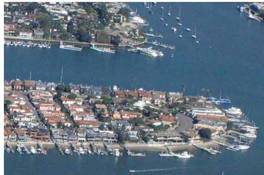
E. Newport Bay