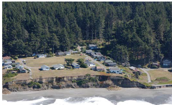
C. Big Lagoon