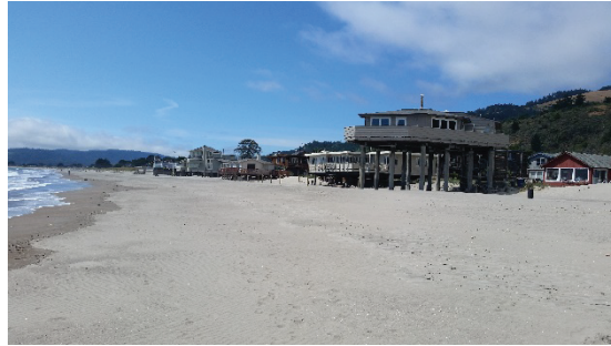
D. Stinson Beach