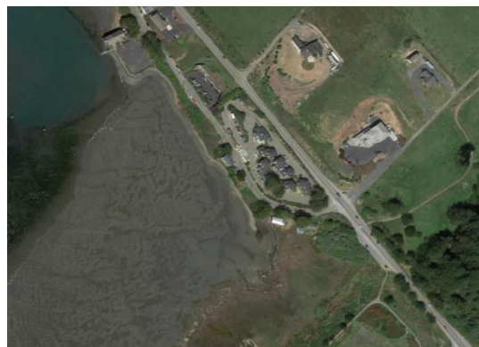
F. Lundberg residence in circle, Bodega Bay, courtesy of Google Earth