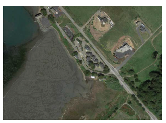
F. Lundberg residence in circle, Bodega Bay