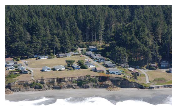
C. Big Lagoon