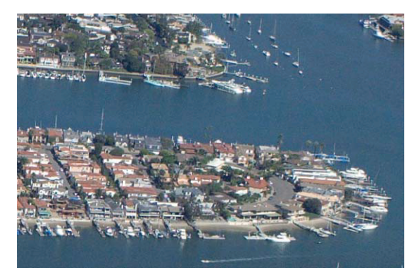
E. Newport Bay