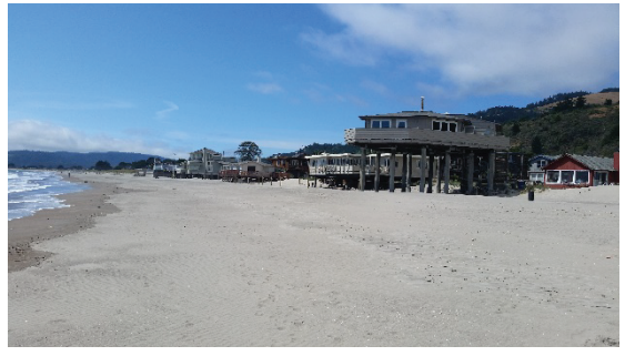
D. Stinson Beach