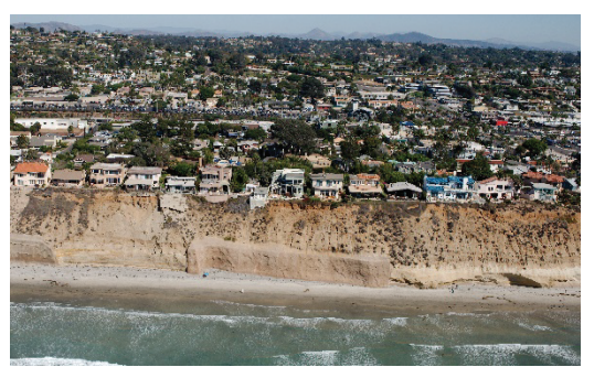
A. Solana Beach