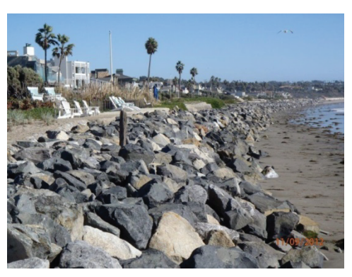
B. Broad Beach