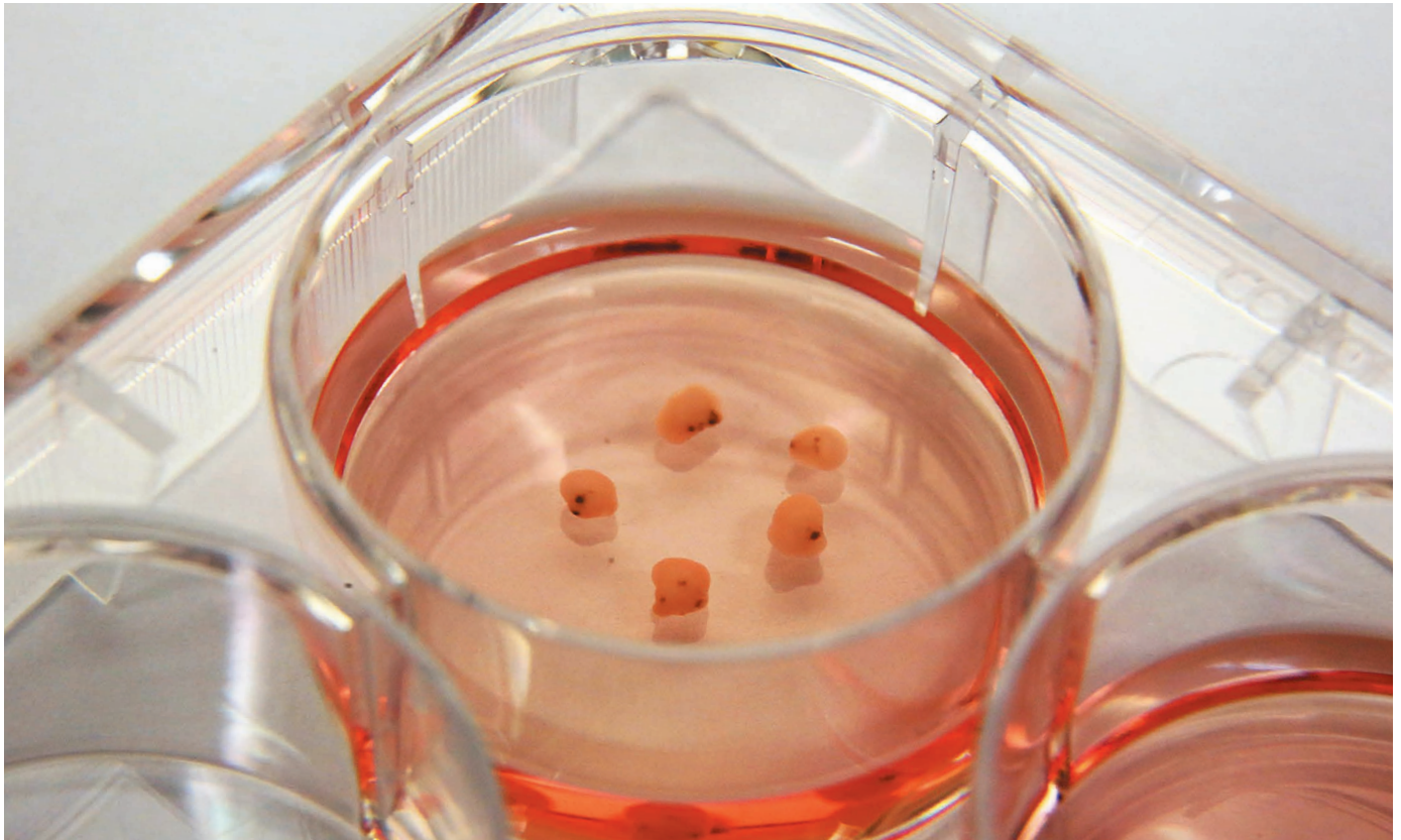
Simplified 3D brain organoids can be grown in a dish using human stem cells as the starting material.