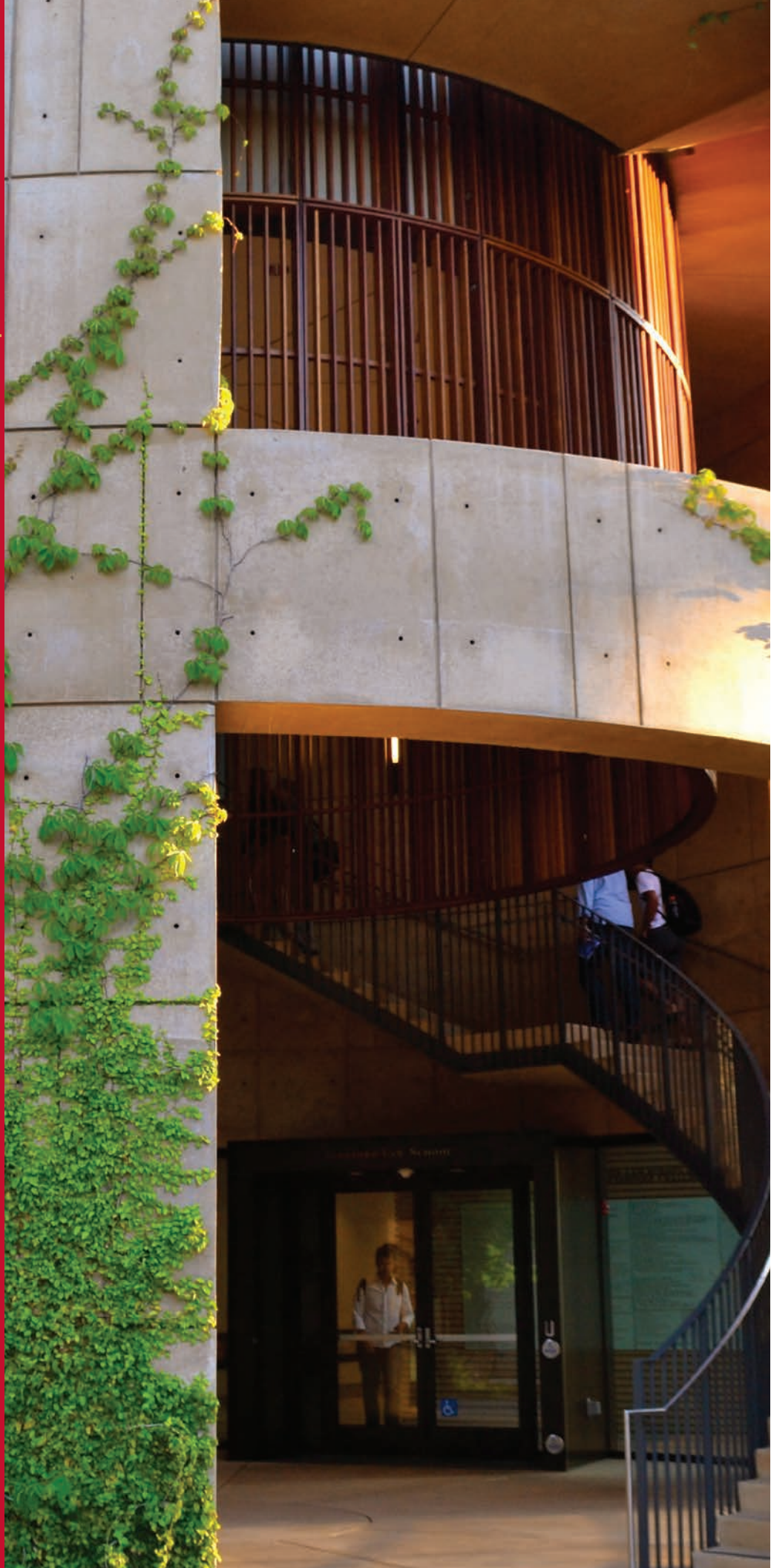
Cover Photo: William H. Neukom Building Terrace

Our alumni, parents, and friends make a profound difference at Stanford Law School. More than 50% of our annual budget relies on the generosity of alumni and friends over time—past and present—and every gift matters. Thank you!