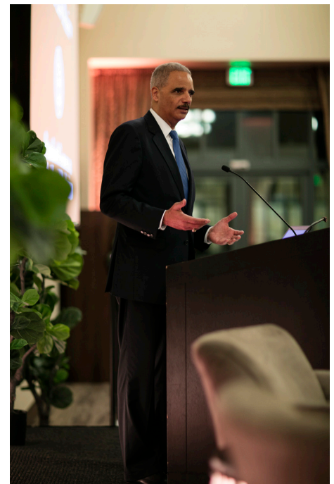
Former Attorney General Eric H. Holder, Jr. giving the evening keynote at the "Lawyers and Leadership: Raising the Bar" Symposium

The Center has played a prominent national role in focusing on this challenge. It has launched a Leadership Initiative featuring programs with celebrated speakers and has helped