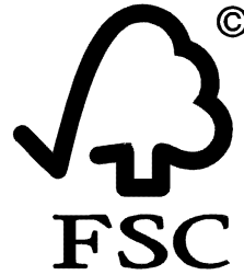
Figure 2: Forest Stewardship Council Logo

The purpose of the ENERGY STAR labeling program is to help consumers identify products that “offer savings on energy bills without sacrificing performance, features, and comfort” and to help “reduce greenhouse gas emissions and other pollutants caused by the inefficient use of energy.” 11 In order to be eligible for the label, products must meet certain lifecycle requirements. In the design and manufacture phase, the label requires that products achieve efficiency through “broadly available, non-proprietary technologies offered by more than one manufacturer.” 12 In the use phase, products must deliver performance equivalent to or better than competing products while using less electricity. Thus, the label aims to reduce the broader environmental and economic impacts by reducing the use-phase emissions and energy bills caused by inefficient appliances.